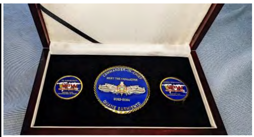
CIC Medallion Set with SVC and JVC Coins