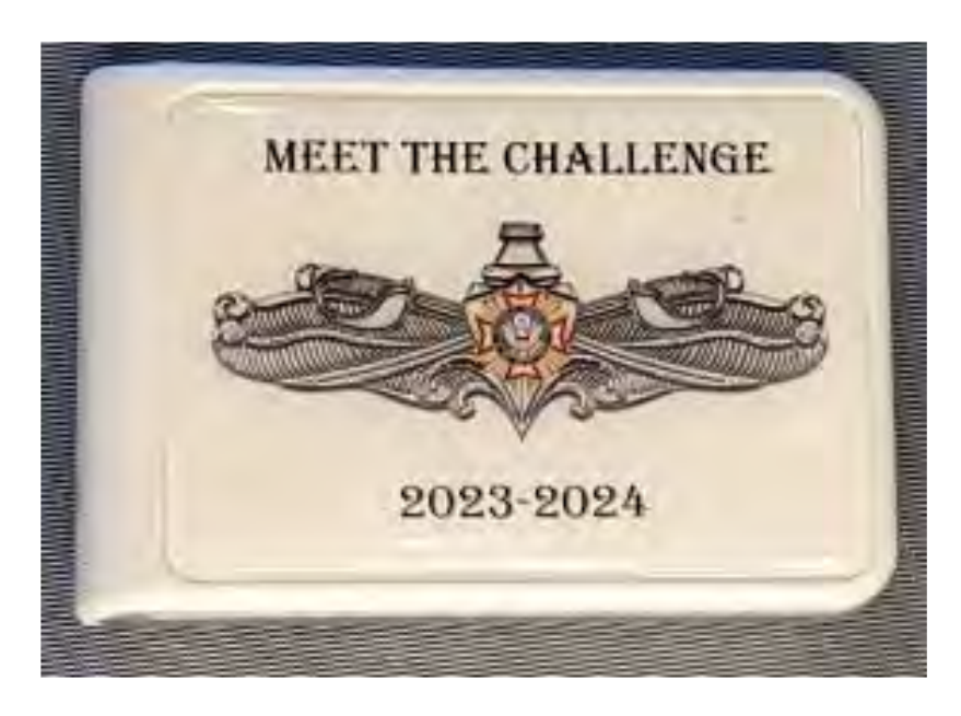
CIC logo power bank