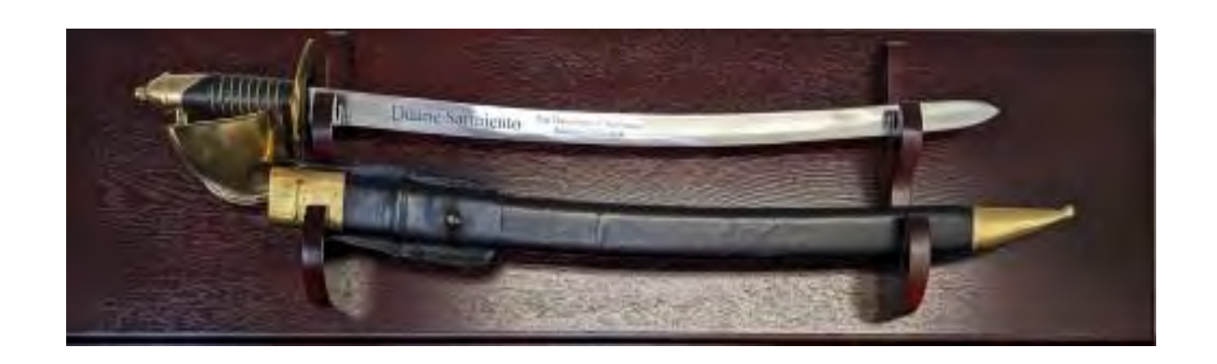
Engraved Navy Cutlass