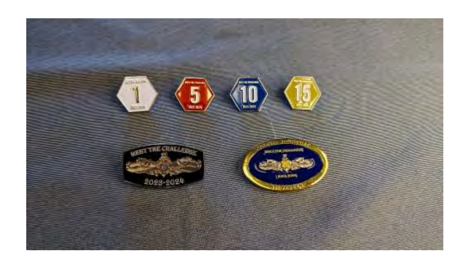
1-, 5-, 10-, and 15-member Recruiting Pins Commander-in-Chief's Pin and Coin