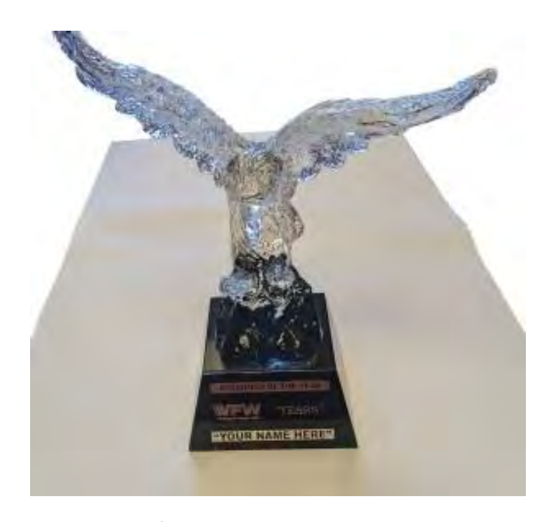
Recruiter Of The Year – Crystal Eagle trophy