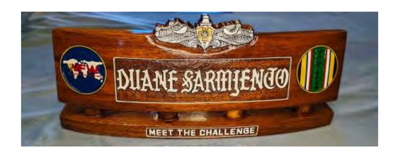
CIC Desk Name Plate (Award winners name with CIC logo and slogan )