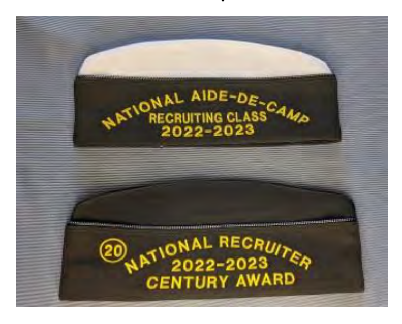
Aide-de-Camp Cap and Century Recruiter Cap