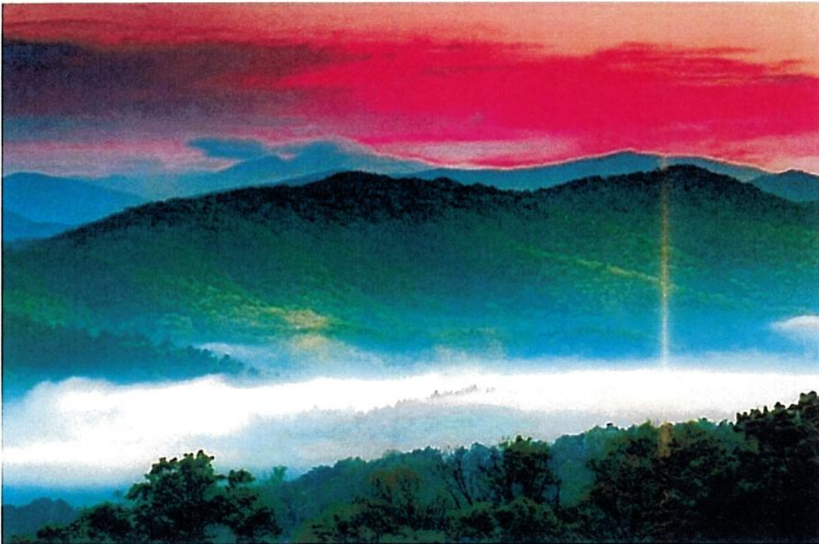
Great Smoky Mountains National Park (one of the only National Parks with no admission fee)