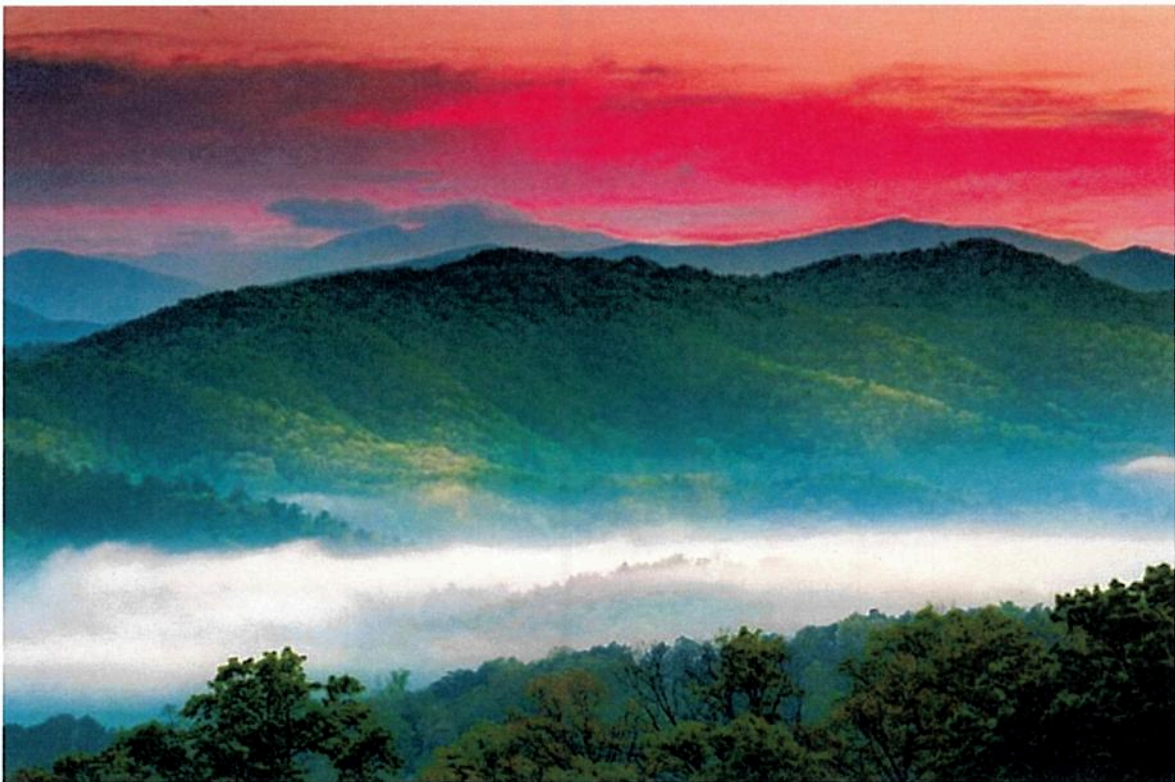
Great Smoky Mountains National Park (one of the only National Parks with no admission fee)