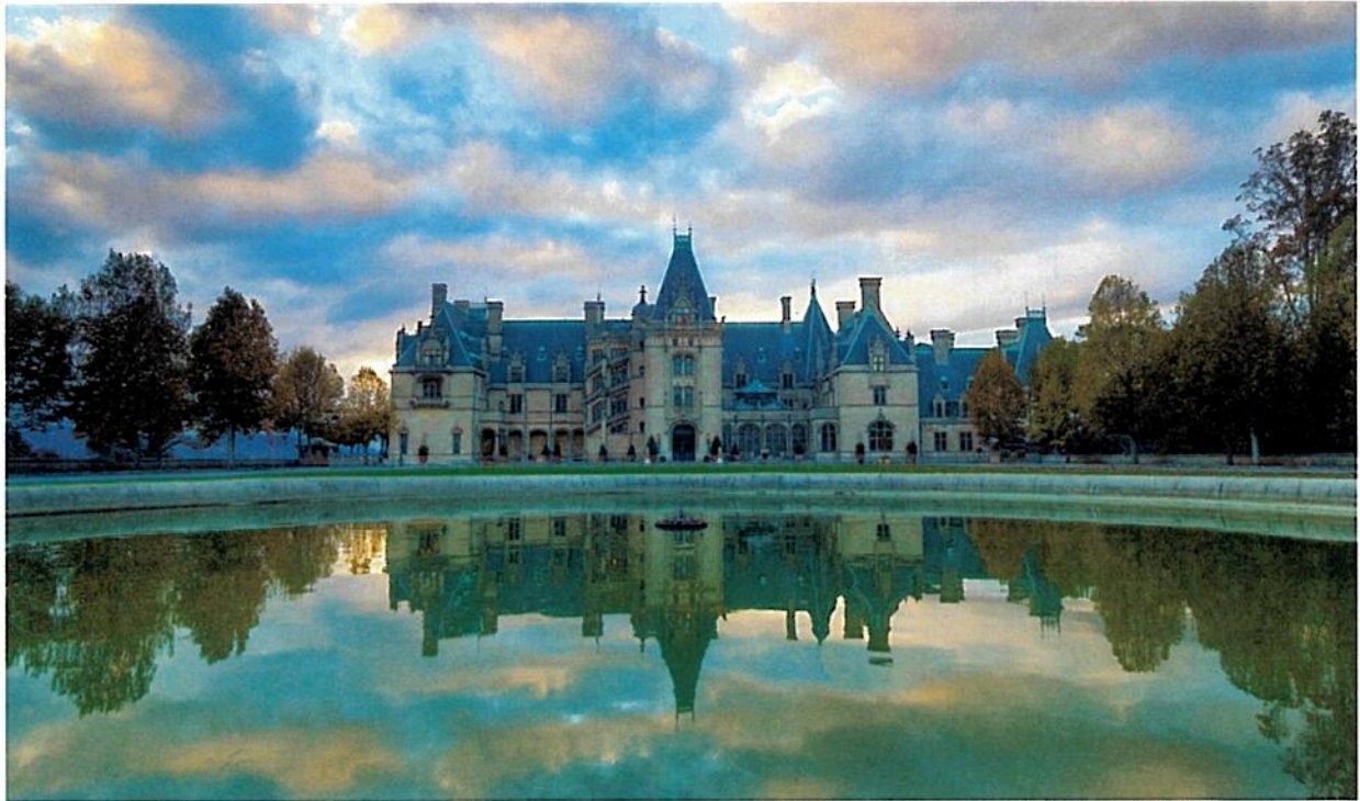
The Famous Biltmore Estate, America's Largest Home (admission fee)