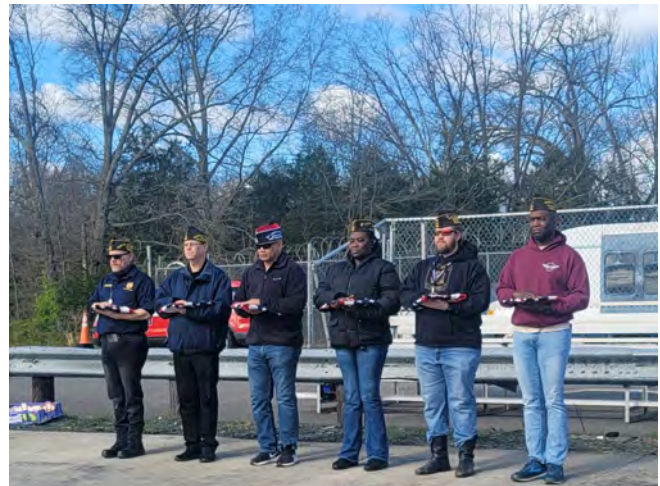
Comrades from each of the branches of service, stand by to retire a flag for the official ceremonial start.