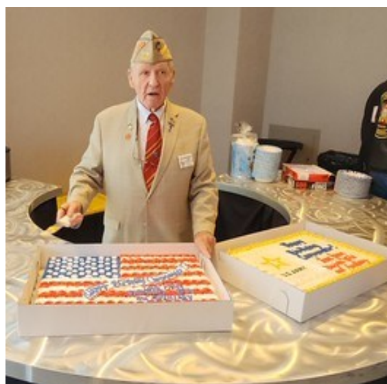
The Department of Virginia was lucky enough to be able to help Commander n Chief celebrate his birthday.