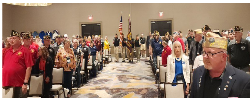
Joint Opening ceremony