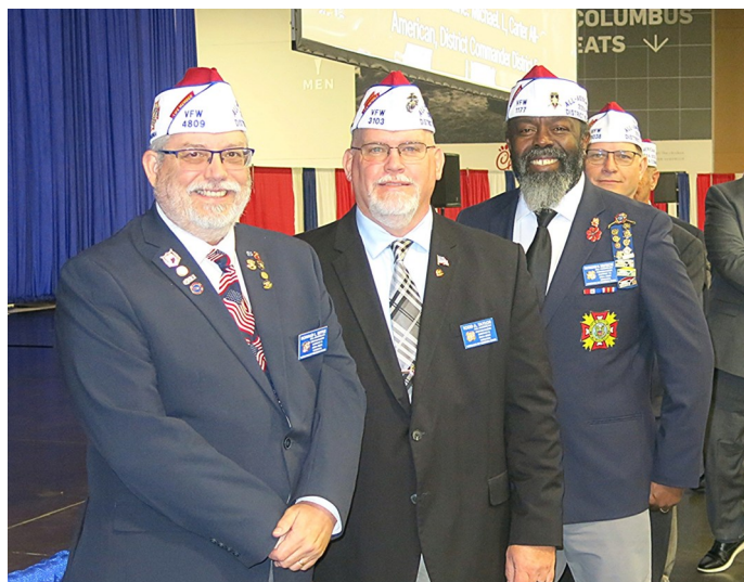
Virginia's All-American District Commanders