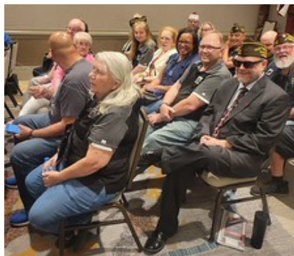
Post 1503 crew at the Joint opening ceremony.