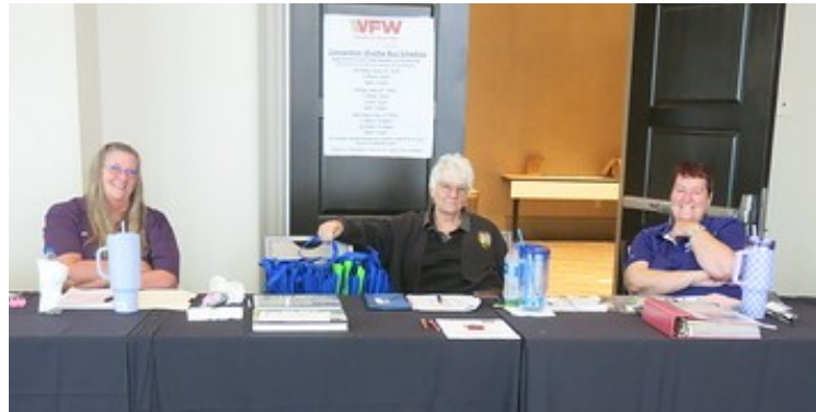
Hard at work at the registration table, the Department Headquarters crew.