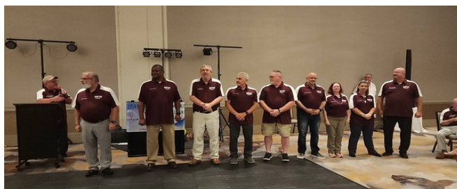
2025-2026 Line officers