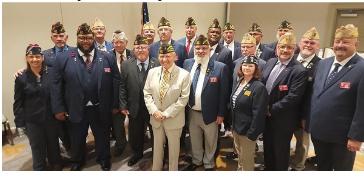
2025-2026 Line officers and District Commanders