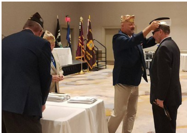
LEFT: Department commander presenting all State hats