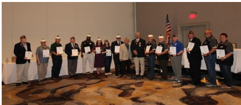
2024-2025 All State Commanders & Quartermaster with National Commander and Chief