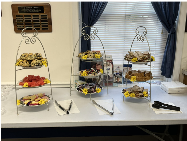
Scones, sandwiches and treats provided by The Things I Love in Manassas