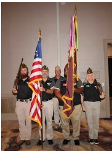
State Honor Guard ready to present the colors at the Joint Opening ceremony.