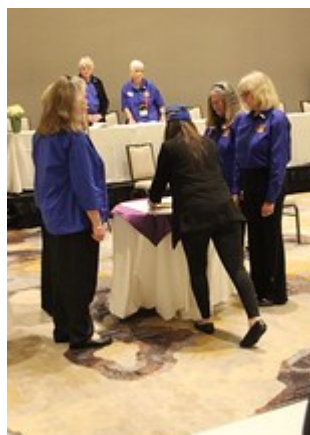
Joint Memorial Service