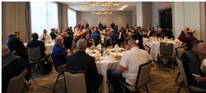
Commanders Club luncheon