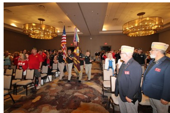
March on the Colors