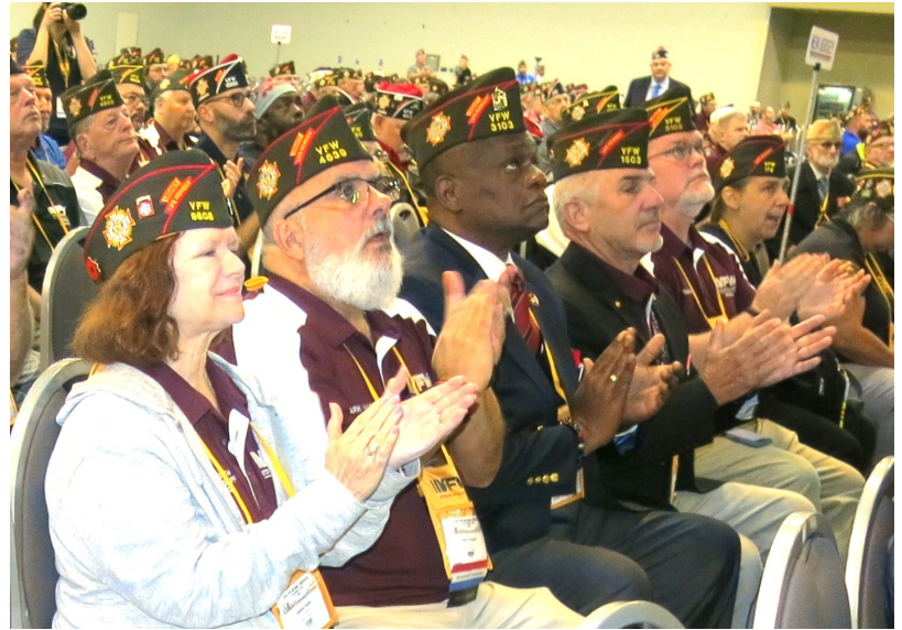
Virginia's delegation applauds the results of the rollcall vote where we posted over 500 delegate votes.