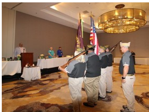
Presenting the Colors