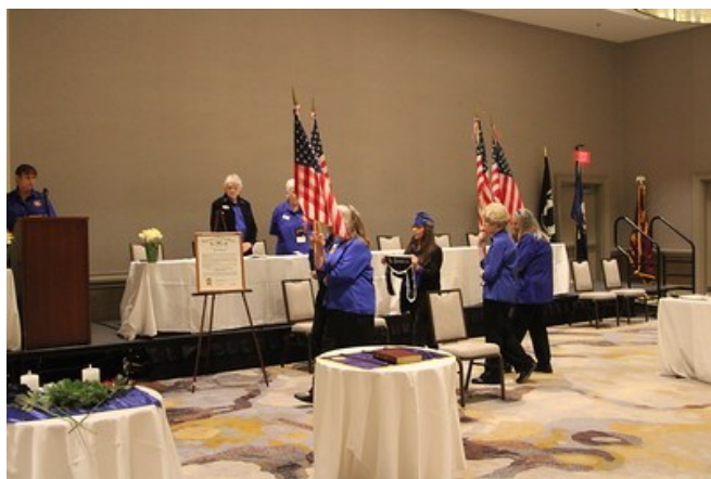
Joint Memorial Service