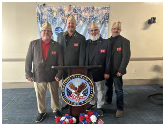
State Commander and Virginia Lt. Governor Winsom Earle-Sears, along with a few of the Department Line officers visit the Department of Veterans Affairs.