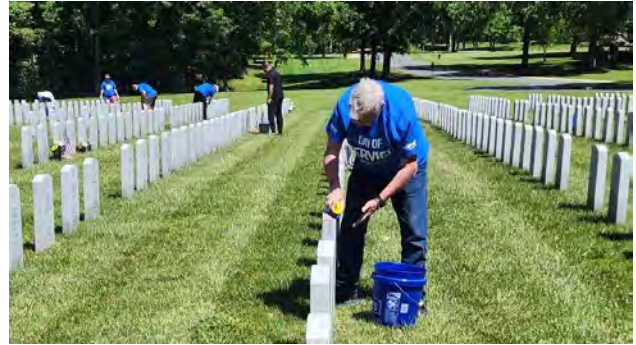
Pictured above, Day of service activities at Quantico National Cemetery cleaning grave stones