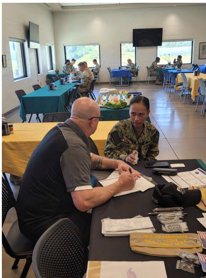
State Commander actively recruiting in Guantanamo Bay Cuba