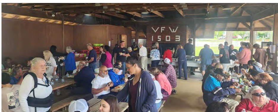
On Memorial Day families and friends from the community came out to the open house picnic to enjoy free food, music and some great entertainment