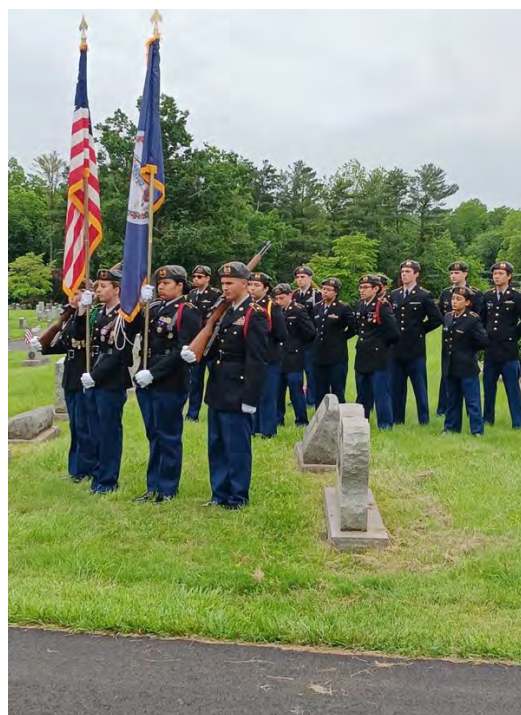
Fauquier County JROTC members