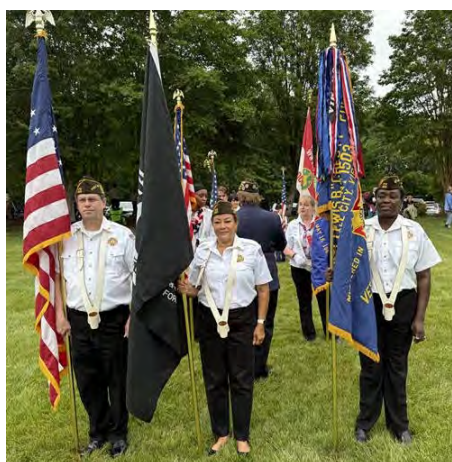
Members of Post 1503 Honor Guard prepare to present the Colors at the Quantico National Memorial Day Ceremony