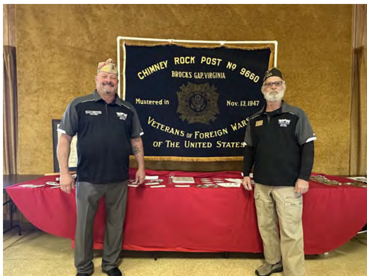
The State Commander's visit to Post 9660