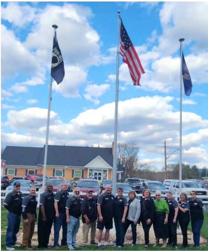
State Commander, Auxiliary President and the State VFW and Auxiliary Line Officers for 2024-2025