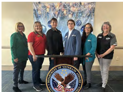
VFW Auxiliary President and the Department Auxiliary Line officers visit the Department of Veterans Affairs