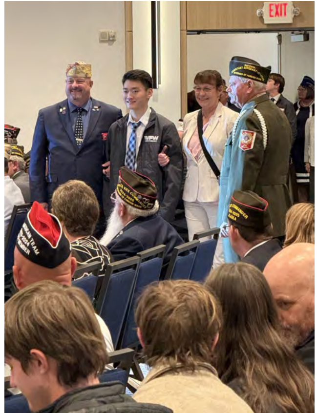
Department Commander and Auxiliary President with the Department Voice of Democracy Winner.