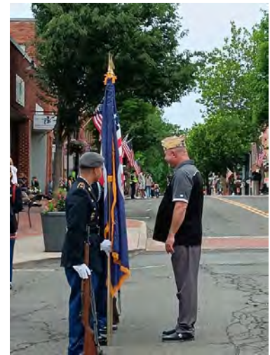
State Commander and the Fauquier County JROTC Members preparing for parade