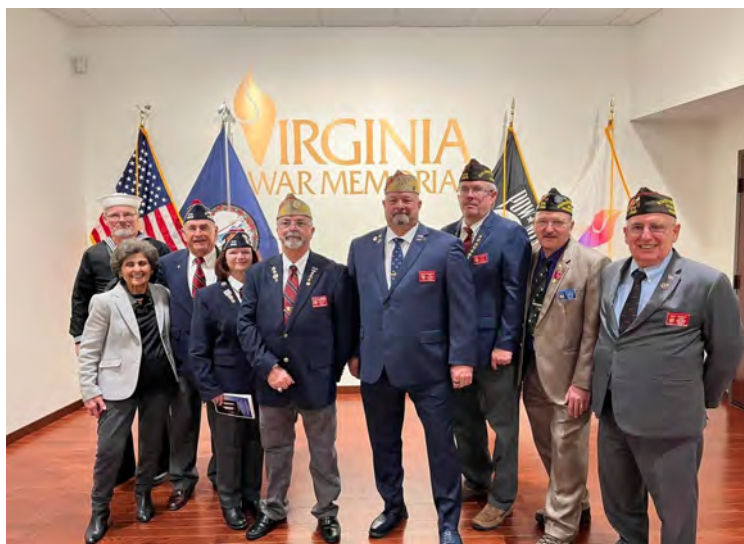
A good VFW presence at Veteran's Appreciation Night at the Virginia War Memorial