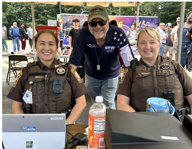
Prince William County Sheriff's Office was on hand to make free ID cards for the children. They each also received a badge to wear