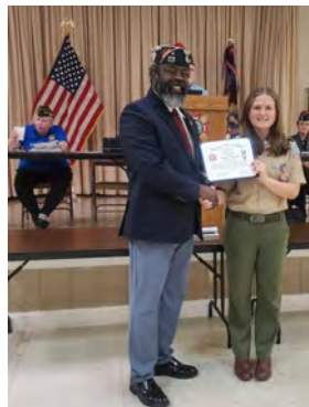
D10 Commander awards the District 10 Scout of the Year