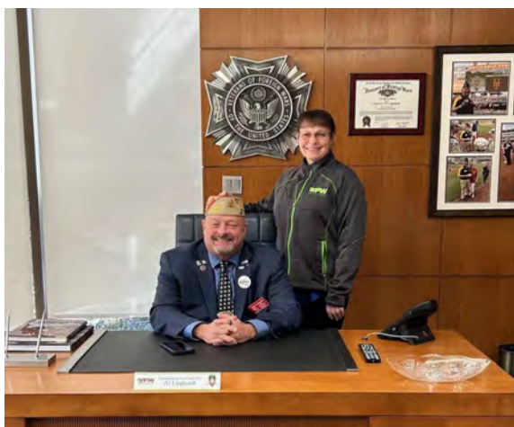
State Commander and State Auxiliary President visit the VFW Commander in Chief in his office