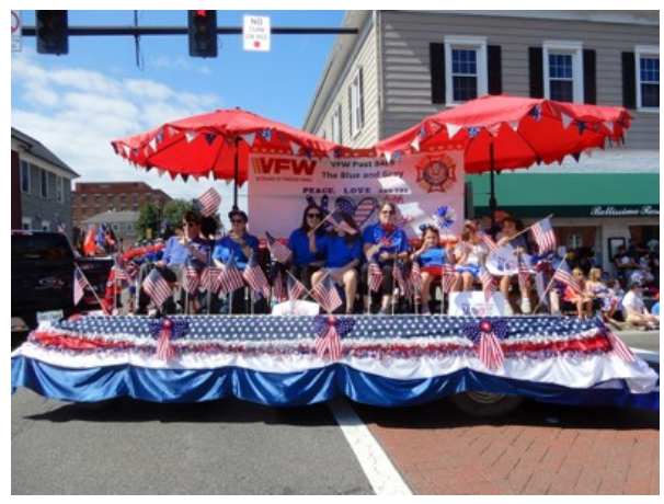
Post parade float used for members that cannot march, Auxiliary, and some children