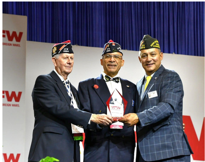
VFW VA FACEBOOK