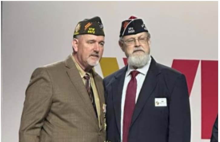
JEFF CARROL / DEI