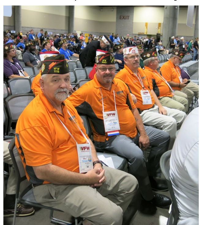
PSC DOC CROUCH