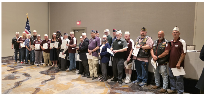
2025-2026 All-Sate Post Commanders and Quartermasters (Part 2)