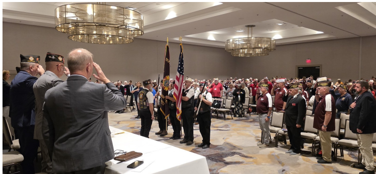
State Color Guard posts the colors