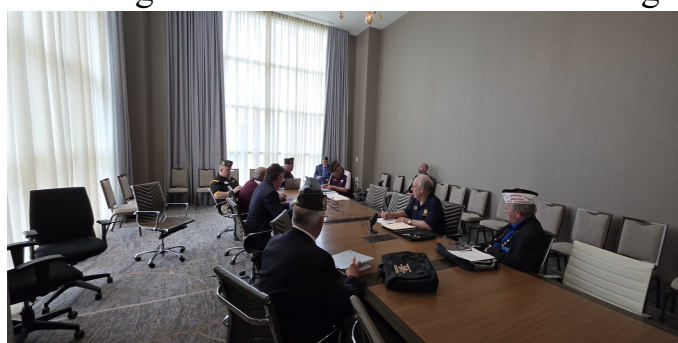
VFW Riders Meeting