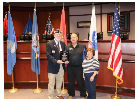
Outstanding Support Hare's Heating Cooling and Electric