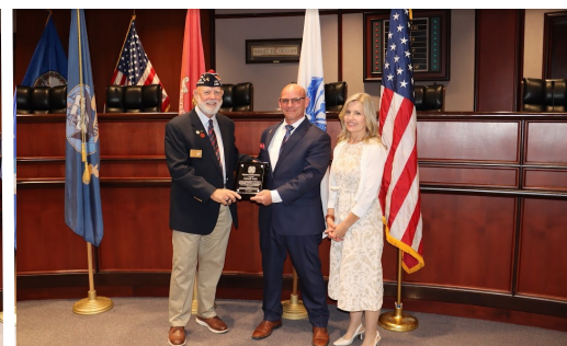
Outstanding Support DW2 Electric