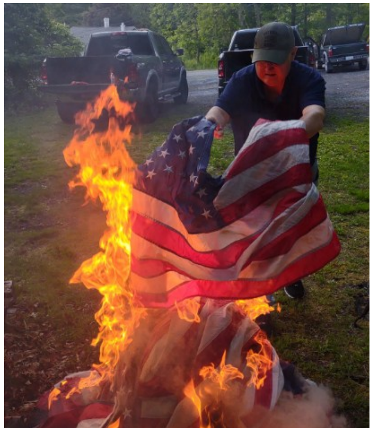
One of the Posts in VFW Virginia District 11 did a dignified retirement ceremony for national flags that have become worn out. Post 4204 in Hot Springs retired 40 flags.