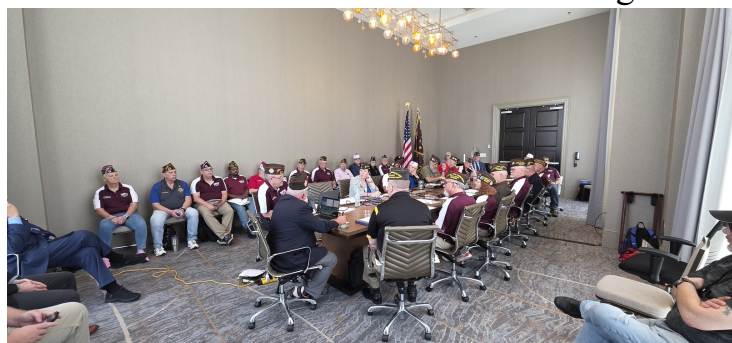
Commanders Club Meeting