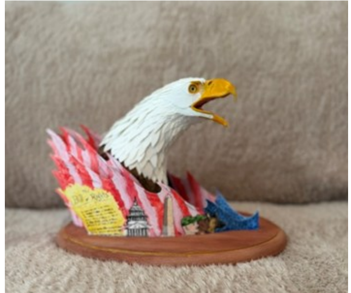
Patriotic Art (3D) by Rachel Elrod