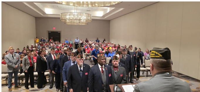
Incoming officers prepare for installation ceremony