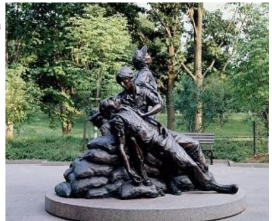
The Vietnam Women's Memorial to honor the women who risked their lives to serve their country. Depicting three women caring for a fallen soldier