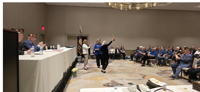
A super proud Auxiliary award winner