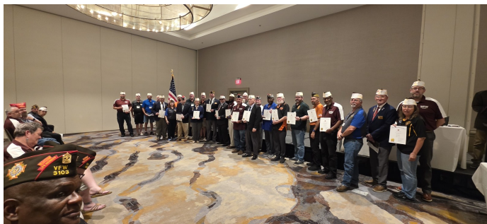
2025-2026 All-State Post Commanders and Quartermasters (Part 1)